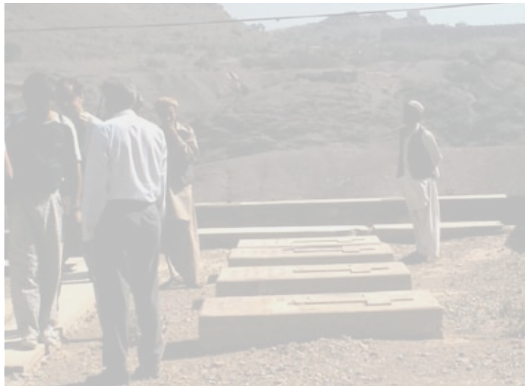
The Ali Masjid Commonwealth War Cemetery, Ali Masjid, on the Khyber Pass, 1988