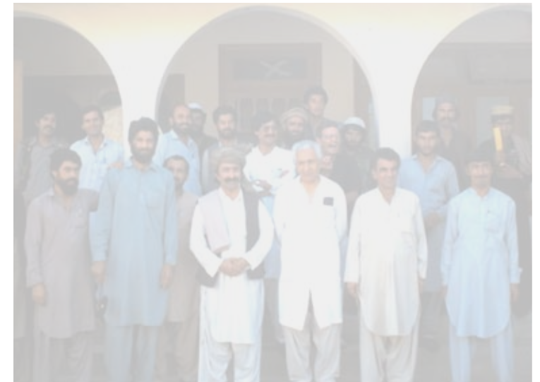
Working lunch: Staff and visitors at one of the small Afghan Hospitals in Peshawar, October 1988

The enormity of trying to bring peace and prosperity to Afghanistan and its surrounding region, and the ferocity with which the Afghan Tribes will defend their