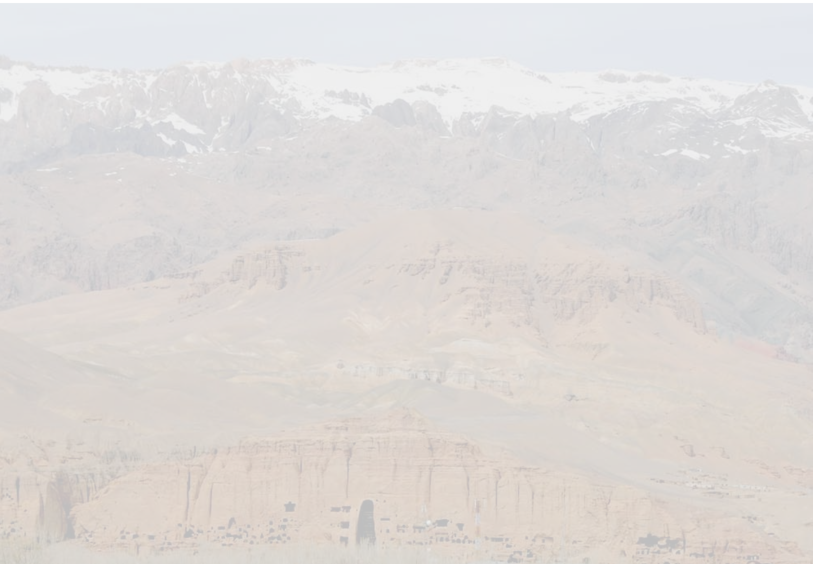
Remnants of a statue of standing buddhas in the Bamy