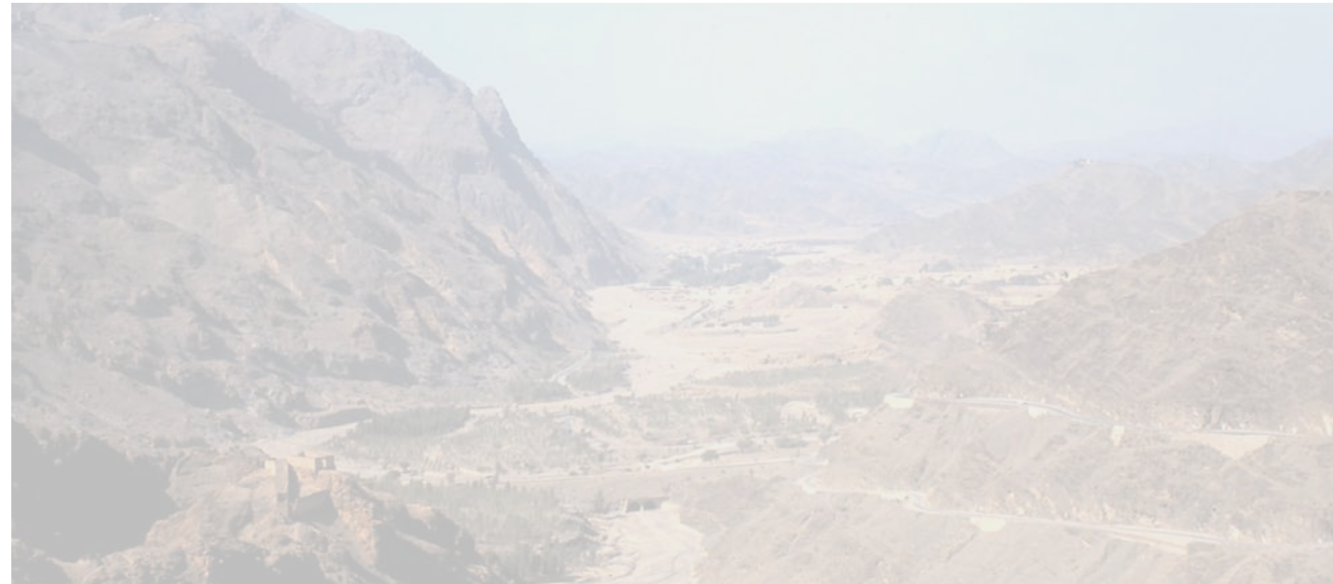
Afghanistan from the top of the Khyber Pass.

For more than three centuries Britain has had profound ties to the Indian subcontinent from which we withdrew in 1947. Since then the flow of wealth and emigration has been in the reverse direction so that we